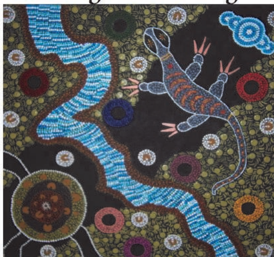
My Country Wanaruah Country Courtesy of Denise Hedges